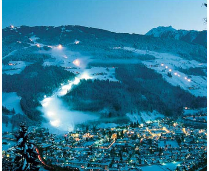
Schladming is preparing the first major international climate-neutral winter-sports event. The mobility concept is focused on electric vehicles.