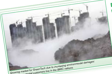
Growing market for GreenTech due to increasing environmental damages: 2.7 billion potential customers live in the BRIC nations.

Chances: Possibly offer of two lines of products: high quality and competitive price; utilisation of the good reputation of European providers; early positioning in these markets creates a growth lead; export of technology and know-how, possibly import of production services.