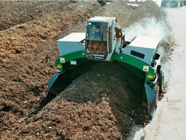
Komtech develops systems on a global basis for mechanical and biological waste treatment. Innovations specifically for processing wood biomass have been recently introduced.