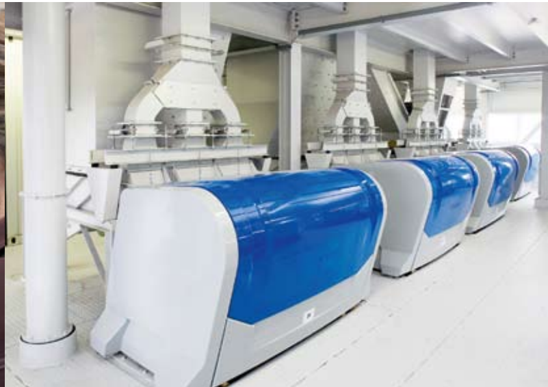
Using a state-of-the-art sensor-based sorting system, CLARITY from Binder&Co separates old glass by colour – including heat-resistant special glass and glass-ceramics.

Waste was once an objectionable subject. Today it is understood as a valuable source of raw material. Based on the highest recycling rate of 70 per cent throughout Europe, recycling innovations from Styria are also extremely popular these days. AUTHOR: Helmut Römer