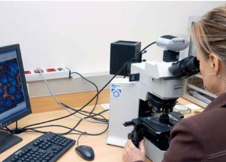
Intensive research is being conducted on biopolymers as a replacement for plastics at the "Polymer Competence Center Leoben." Biopolymers consist of regenerable raw materials and are completely biodegradable.