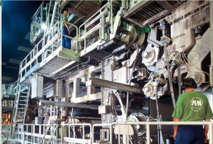
In Frohnleiten Mayr-Mellnhof recycles beverage packaging. Incidentally, four-fifths of the volume of pulp for MM-Karton originates from recycled paper.

the automated sorting using machines such as those manufactured by Binder+Co or BT-Wolfgang Binder in Gleisdorf. The systems are used for plastics, paper, glass and mineral sorting. They fully automatically recognise the colour as well as the type and quality of a variety of materials and sort them with the highest degree of precision.